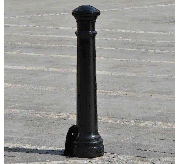
Indicative low-level bollard intent